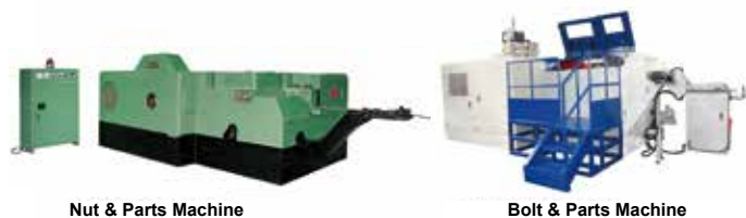
Nut & Parts Machine

Screw & Nut, Fasteners Machine, Auto Parts, Industrial Parts, Wire