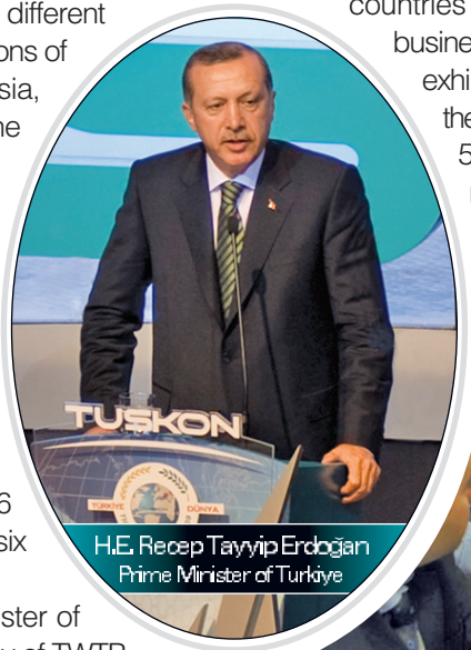
H.E. Recep Tayyip Erdoğan Prime Minister of Türkiye

H.E. Recep Tayyip Erdoğan, the Prime Minister of Türkiye, participated in the inaugural ceremony of TWTB 2009 and addressed to both Turkish and international businesspeople.