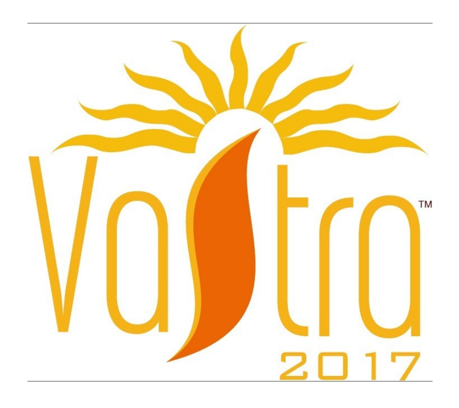
VASTRA - An International Textile & Apparel Fair 2017