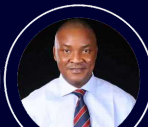
H.E. HON. SILAS AGARA

DIRECTOR GENERAL, NATIONAL DIRECTORATE OF EMPLOYMENT, NIGERIA