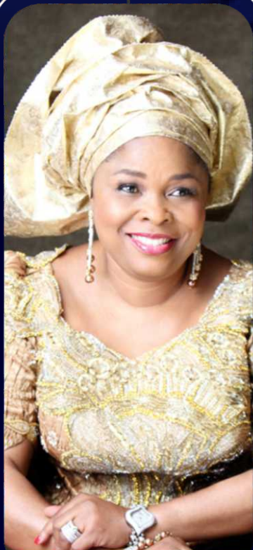
HER EXCELLENCY DAME PATIENCE GOODLUCK JONATHAN

Keynote Speakers: Hear from influential leaders such as: