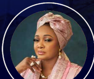
H.E. HON. IMAAN SULEIMAN-IBRAHIM

MINISTER, FEDERAL MINISTRY OF WOMEN AFFAIRS, NIGERIA