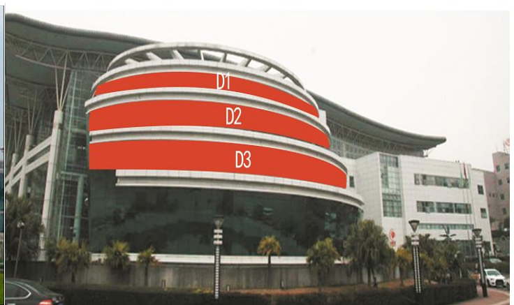
D1: 72m X 3m D2: 60m X 3m D3: 50m X 3m