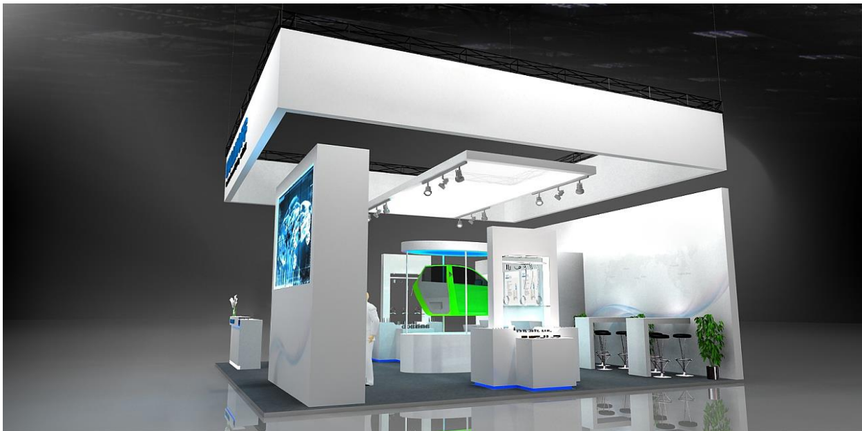
This picture is for reference only